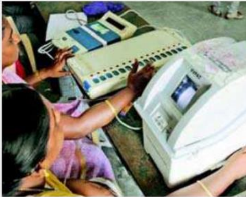
All for audit: Election officials checking VVPAT machines.

The Election Commission feels that with most opposition parties having declared their lack of faith in electronic voting machines, VVPAT machines are the need of the hour